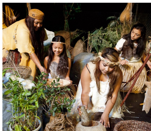
Journeys from the Past, 2012

To create these tools CIMCC is partnering with Miromaa ALTC, Aboriginal Language and Technology Centre. Miromaa is a content management system program that was developed specifically to aid in language conservation, reclamation and dissemination work. Miromaa is a user friendly database that helps organize and produce outcomes for language preservation and revitalization activities.